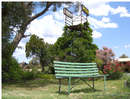
Park- like grounds at the High Country Motel