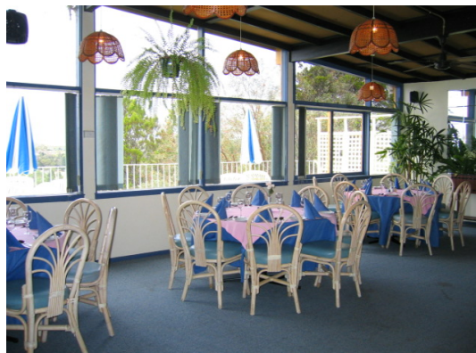
Restaurant with outstanding town and rural views