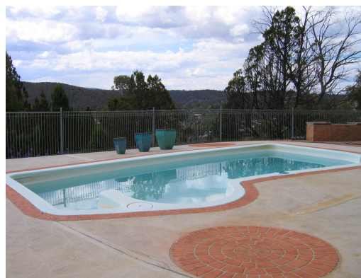
Relax by the motel's swimming pool